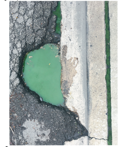
TOXIC PUDDLE ← where did it come from?