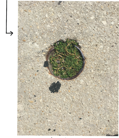
It is how we created windows to the ground and to plants and "thanks"