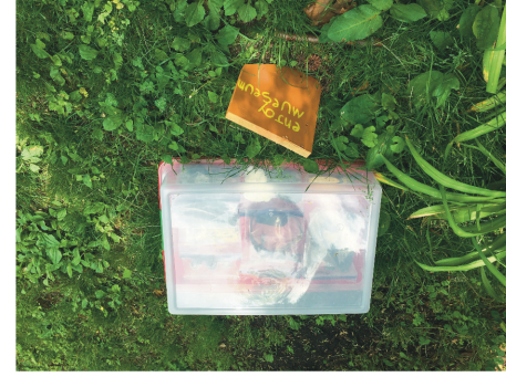
Engle Museum: Insects, rocks, pinecones, etc.

a museum found in a front yard on a mid-summer walk. I enjoyed the museum very much. It reminded me of myself from many months ago and I wanted to log